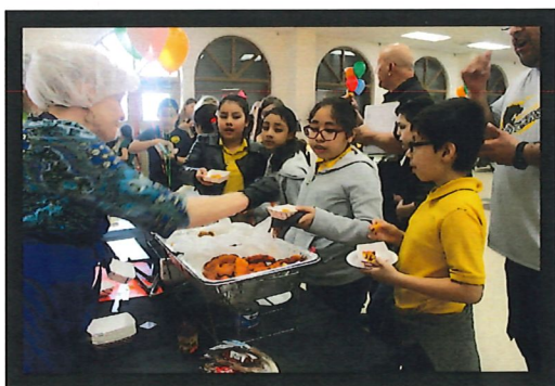
Perez Elementary students participating in a food tasting sponsored by the Food & Nutrition Services Department

Child Nutrition Program – The Child Nutrition Program continues to enhance its operations. As a result of the administrative team's continued effort to streamline operations, increase meal participation, cut costs and increase revenue, the program experienced a profitable year and was able to maintain a positive fund balance. The District continued with breakfast in the classroom and the supper program in the 2018-2019 school year. The District's top priority is to ensure that each child receives a healthy breakfast, lunch, and dinner.